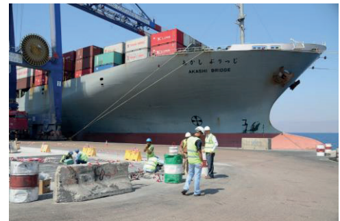
This photograph shows the work going on whilst the Port continues to operate with minimum interruption

Gantrail - A world of crane rail expertise.