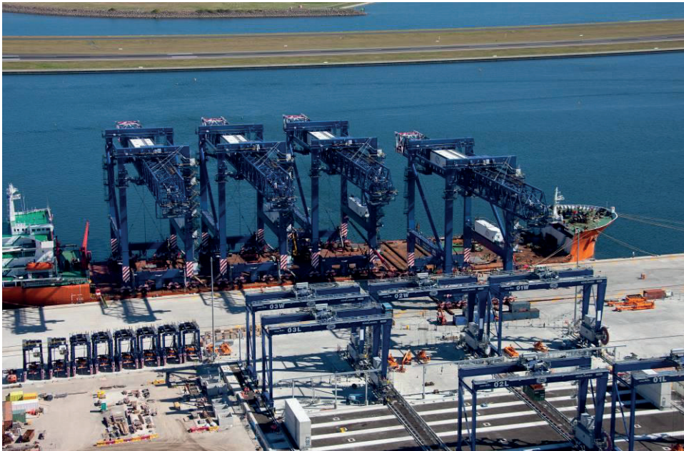
Aerial view of Port Botany

Port Botany in Sydney is Australia's second largest container port. It was of strategic importance for Hutchison Ports, who were looking to increase their presence on the East Coast, in order to become a viable option for shipping lines.